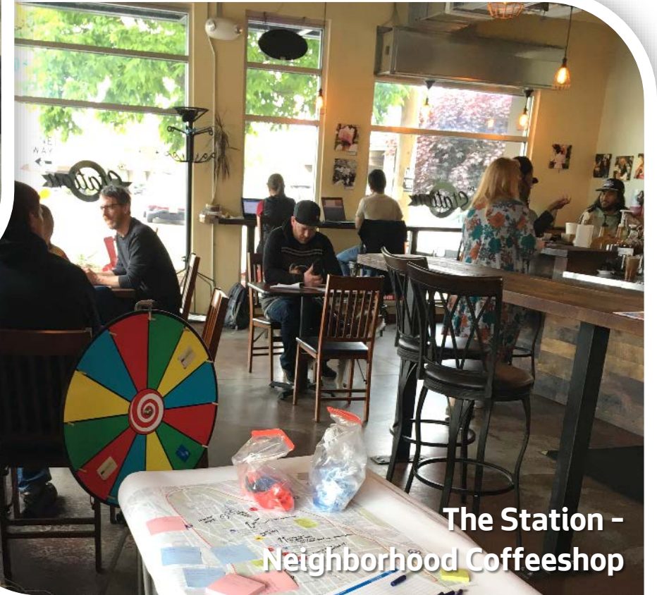
The Station - Neighborhood Coffeeshop