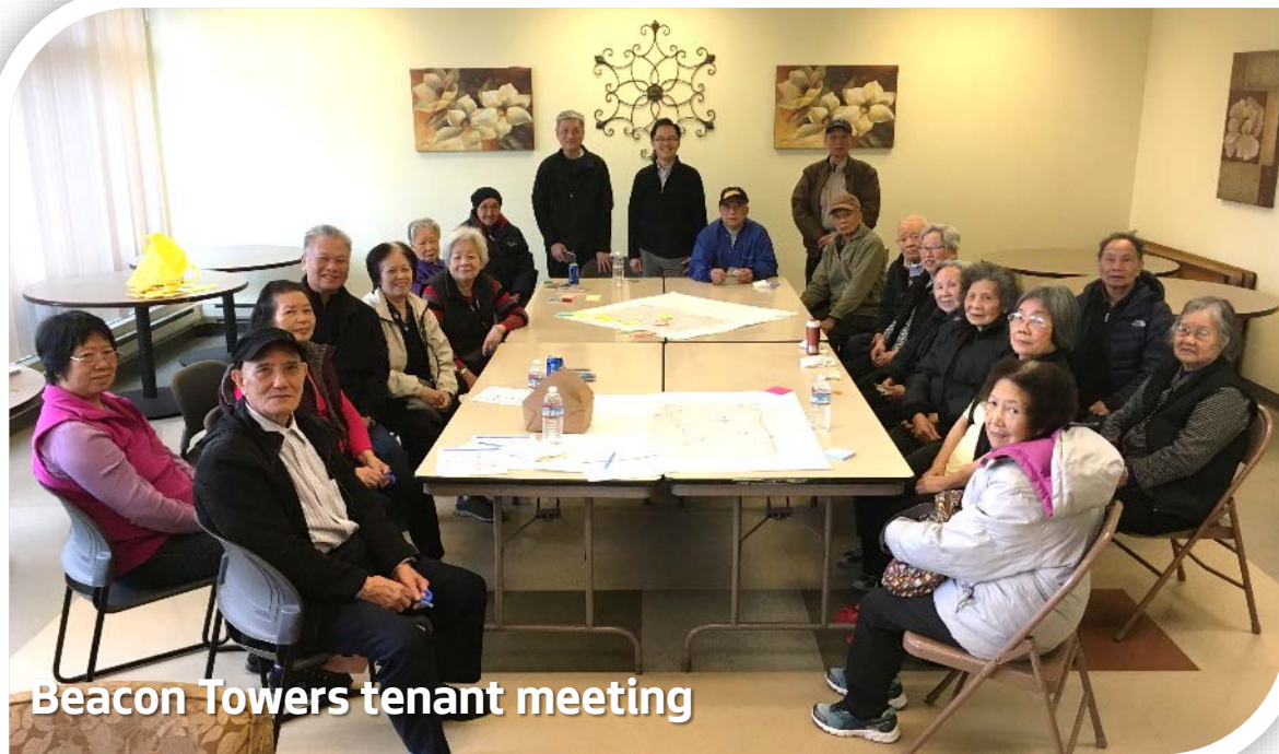
Beacon Towers tenant meeting